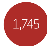
photovoltaic panels and 11 inverters