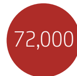
square feet of solar power installation