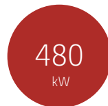
of power generation

Finally, the Centrica Business Solutions team installed a highly cost-efficient backup energy source, in the form of an innovative mobile